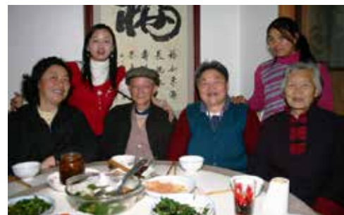
A Chinese family gathers for a home-made meal and a conversation about water with Baytel researchers