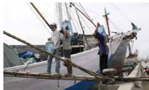
Transporting drinking water between islands in Indonesia