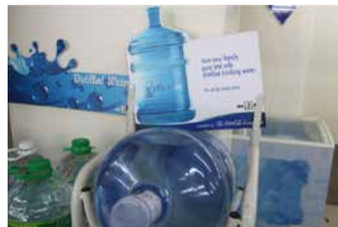
Bulk Bottled Water at a Store in the Philippines