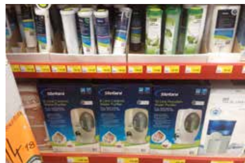
A Baytel Retail Audit in Australia