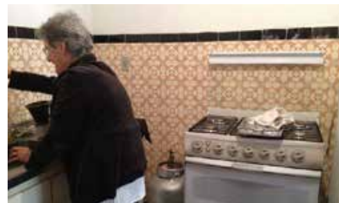
This retired Brazilian woman brings spring water home for drinking, but uses tap water for dishes.