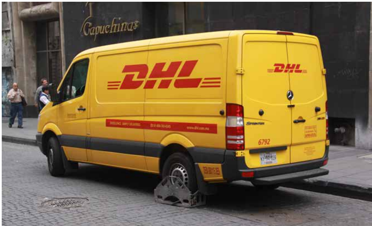
Sometimes outside help is needed to move things along

We provide confidential consulting services as well as off-the-shelf market, industry and technology reports. Baytel's coverage is global.