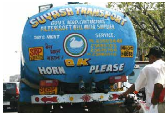
A water tanker making daily deliveries in Mumbai

Baytel's Principals have multiple advanced degrees in disciplines like electronics, computer science, biology, molecular genetics, mathematics, etc. We make it a point to understand and provide coverage of all relevant technologies enabling these products.