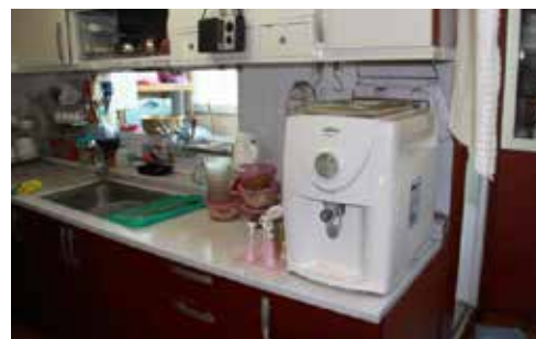
A Reverse Osmosis System in Korea