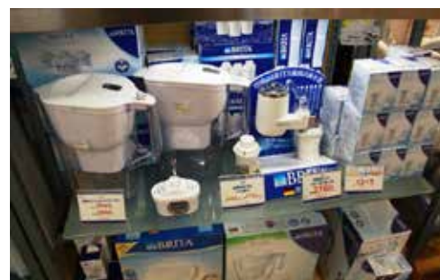
Brita Products in Taiwan