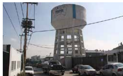
Filling water tankers for delivery to homes & offices in Mexico