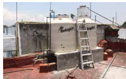
Home Water Storage in Mexico