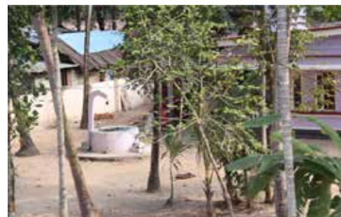
A dug well supplies water for this family in rural Kerala